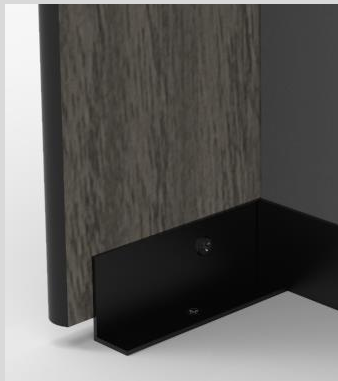
10mm standard via angled bracket to rear Divider in Floor Channel