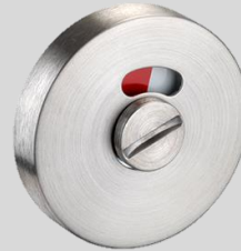
Stainless Steel or Black Texture Powdercoated Furniture